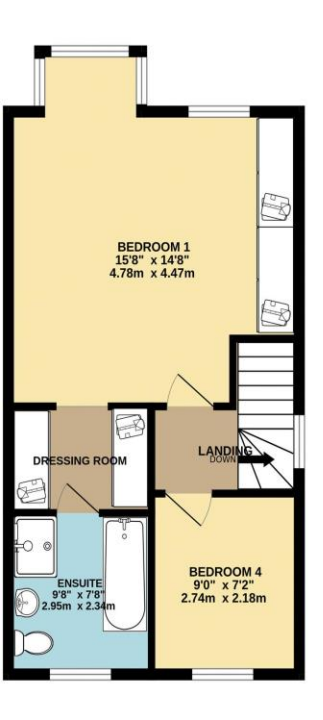
TOTAL FLOOR AREA : 1359 sq.ft. (126.3 sq.m.) approx. Made with Metropix ©2024